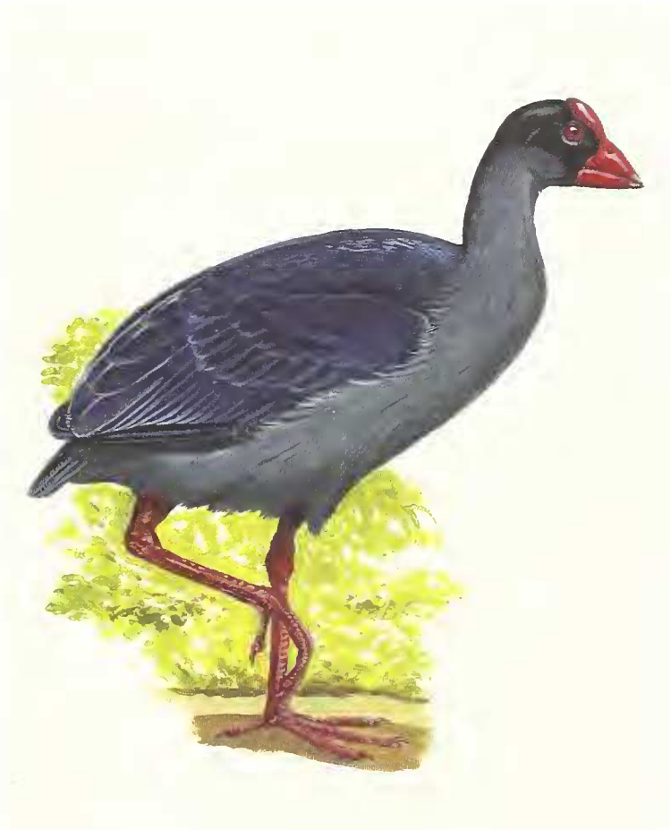
Figure 21. Reconstruction of a blue-coloured (i.e. younger) Lord Howe Gallinule Porphyrio albus , before it becomes white (Julian P. Hume)